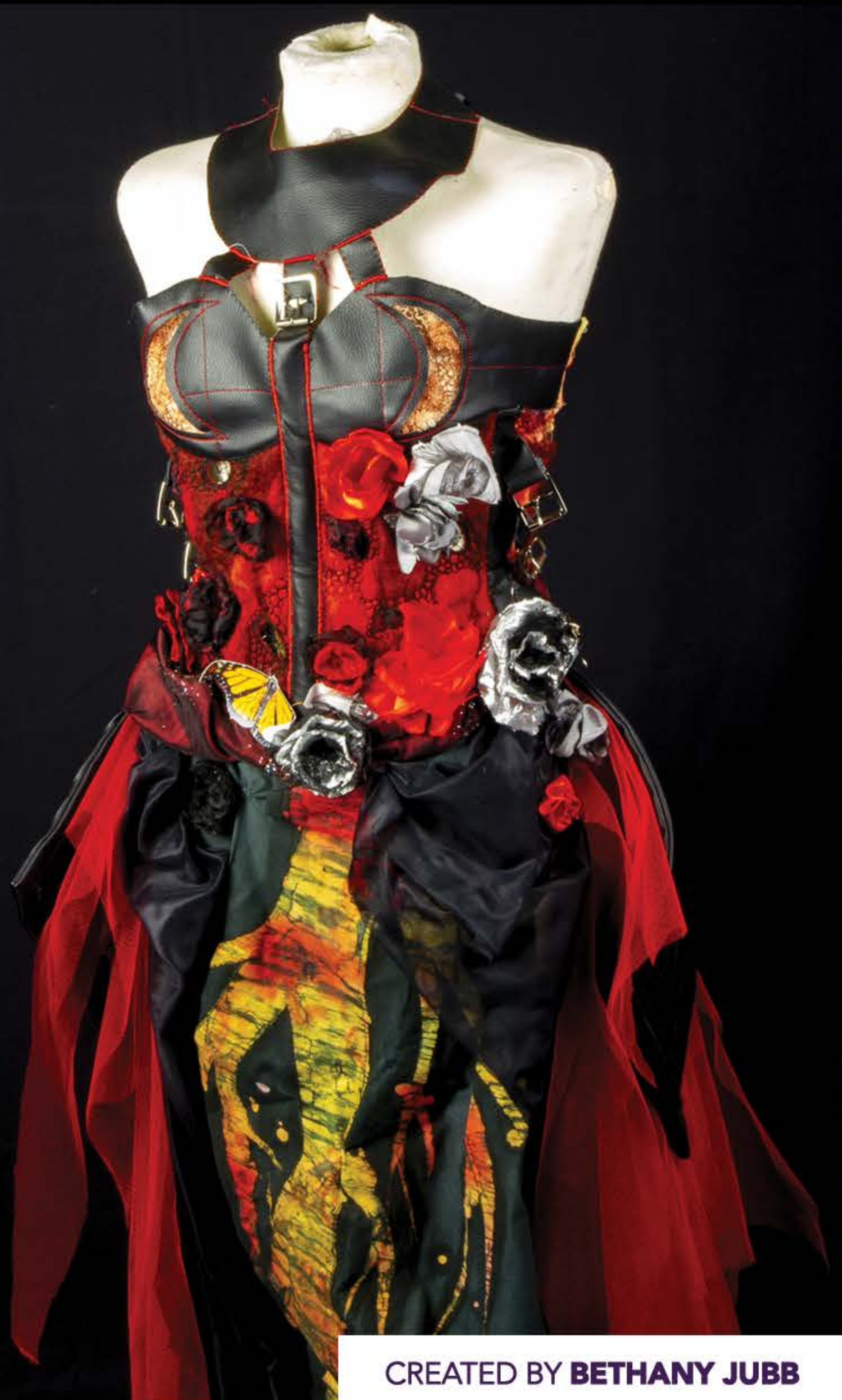
CREATED BY BETHANY JUBB