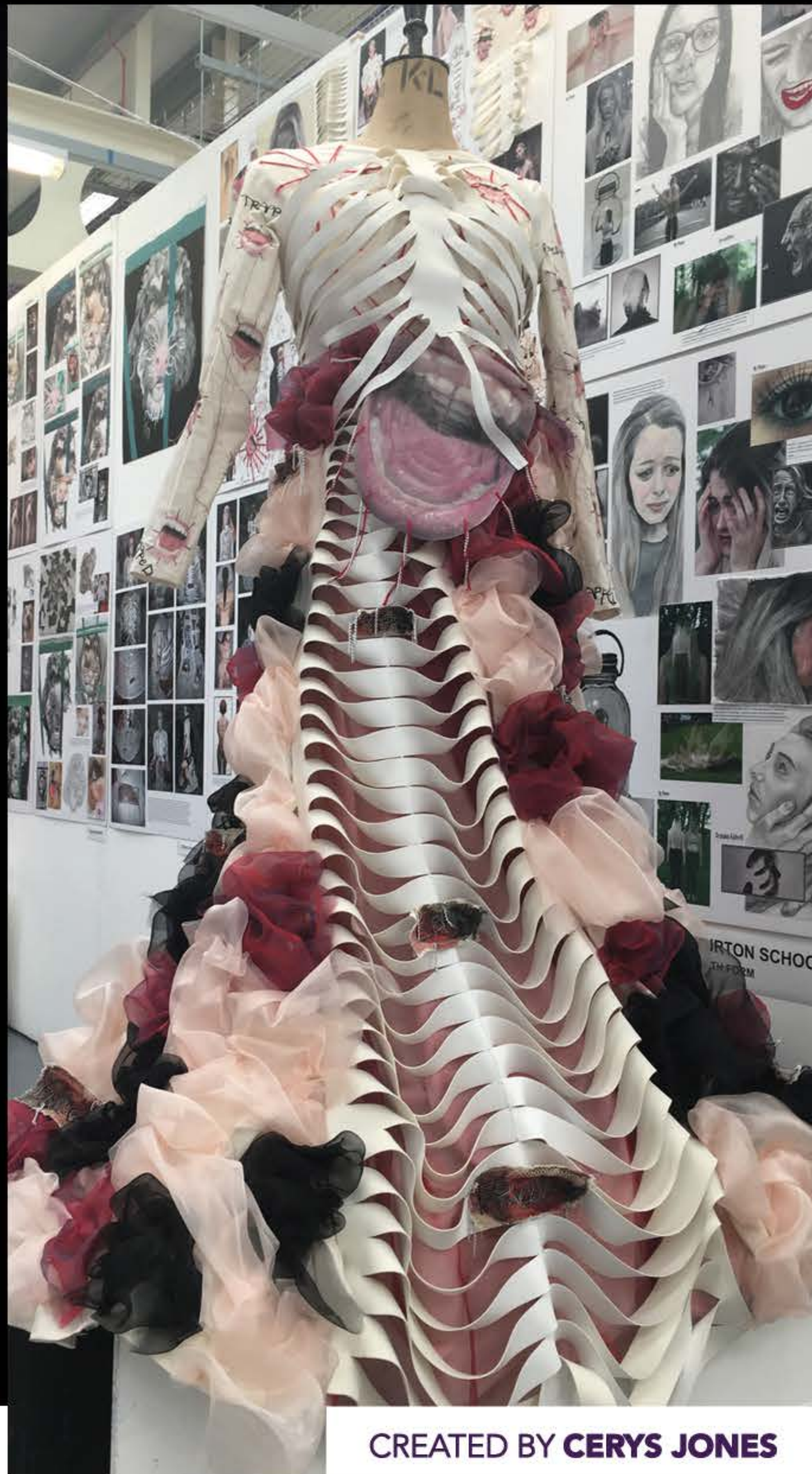
CREATED BY CERY'S JONES