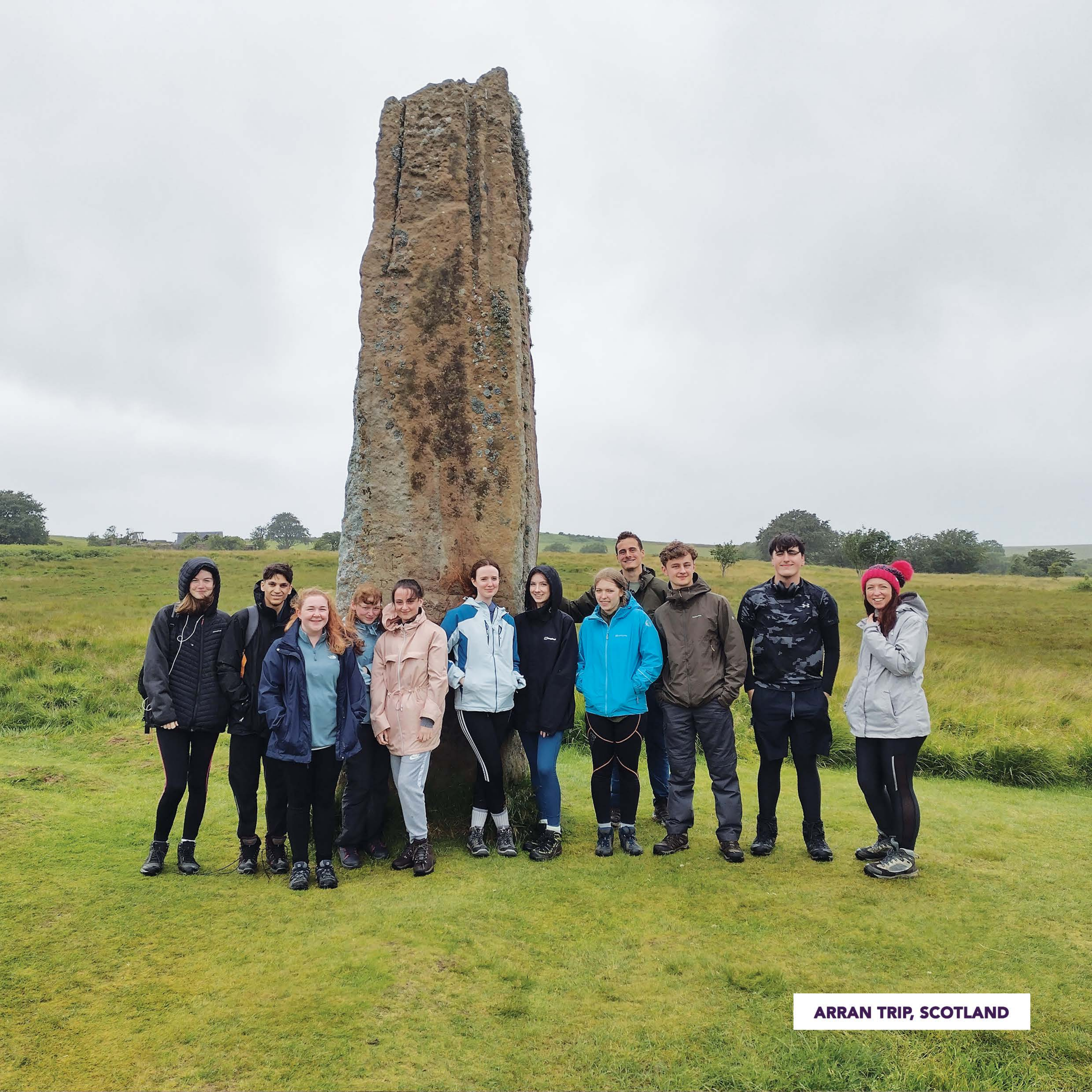
ARRAN TRIP, SCOTLAND