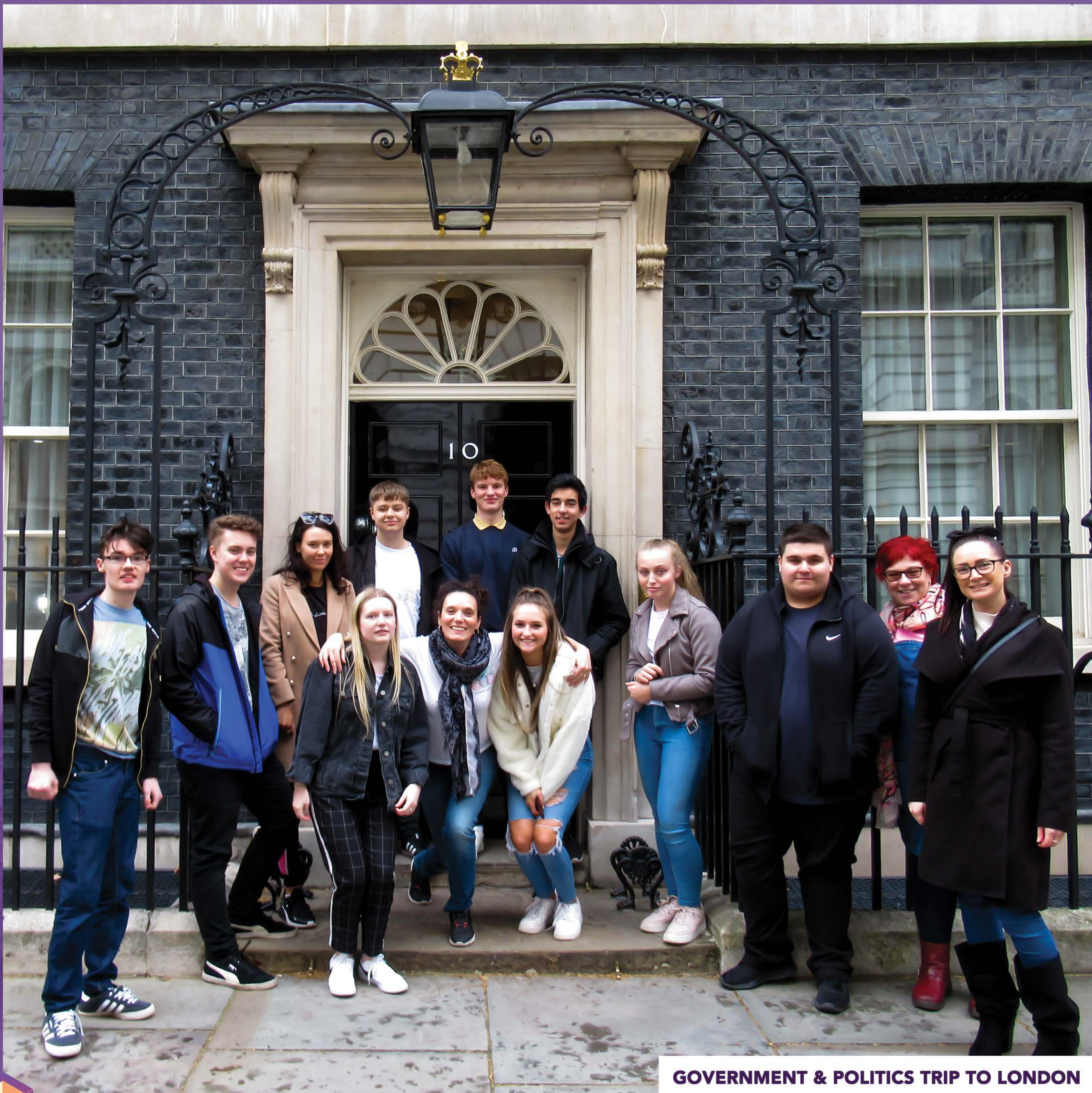
GOVERNMENT & POLITICS TRIP TO LONDON