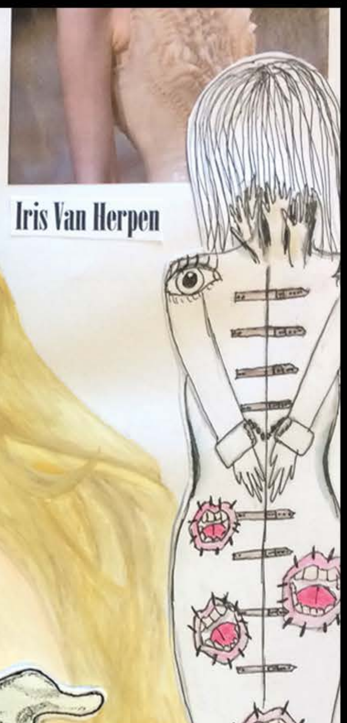
Iris Van Herpen