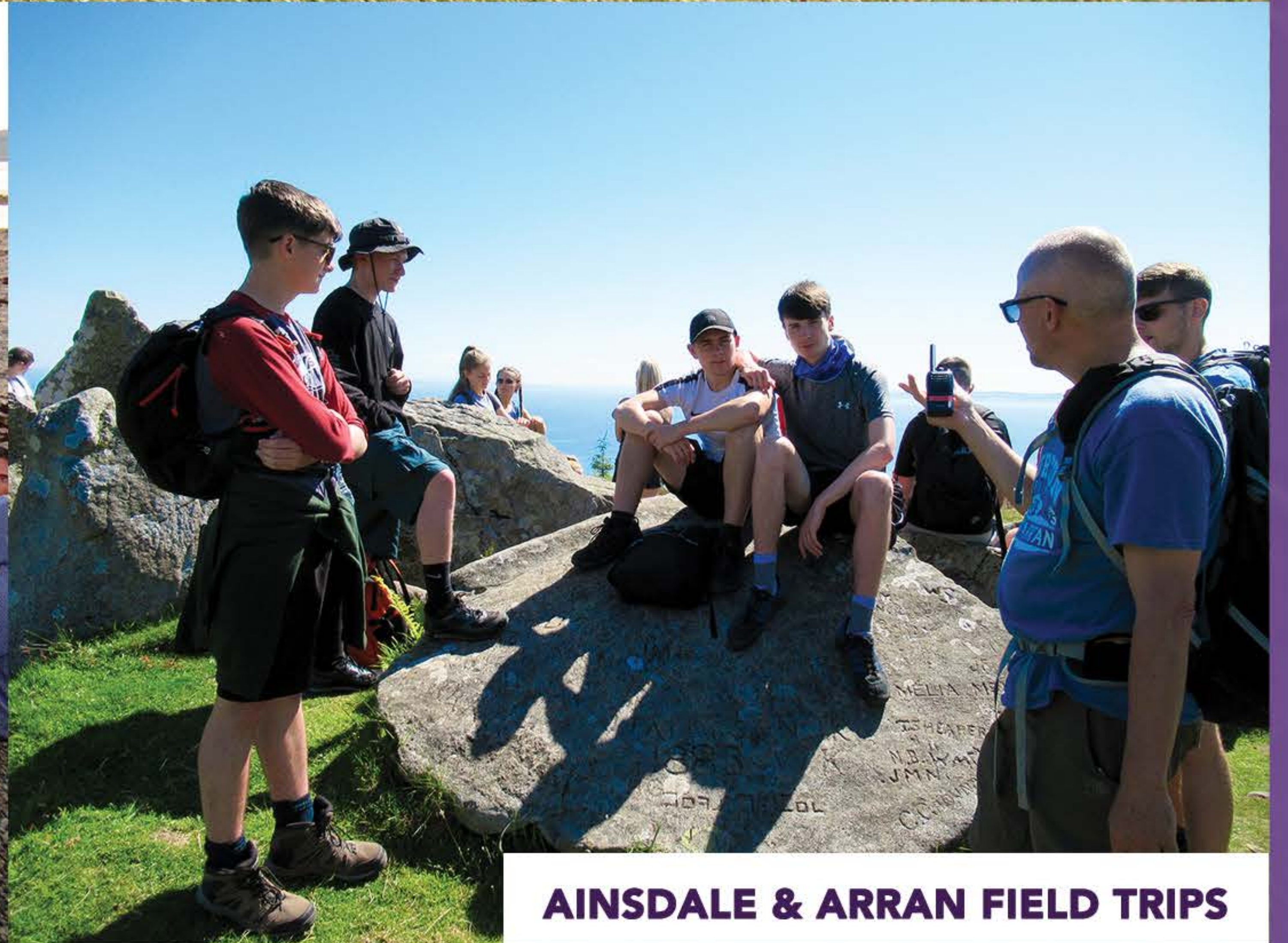
AINSDALE & ARRAN FIELD TRIPS